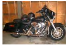
2006 Harley Davidson