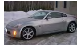
2003 Nissan 350Z (14,000 mi.)