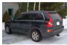
2003 Volvo XC90 (43,000 mi.)