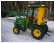
John Deere 855 Tractor (280 hrs)