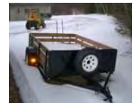
Utility Trailer w/ramps (new)